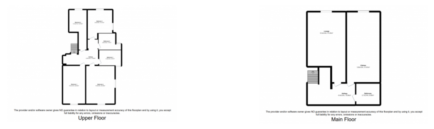
This floorplan is for illustrative purposes only and the location of doors, windows and other items are approximate.

Agents notes: All measurements are approximate and for general guidance only and whilst every attempt has been made to ensure accuracy, they must not be relied on. The fixtures, fittings and appliances referred to have not been tested and therefore no guarantee can be given that they are in working order. Internal photographs are reproduced for general information and it must not be inferred that any item shown is included with the property. Copyright © 2025 10078620 Registered Office: , 207 Clarendon Road LS2 9DU