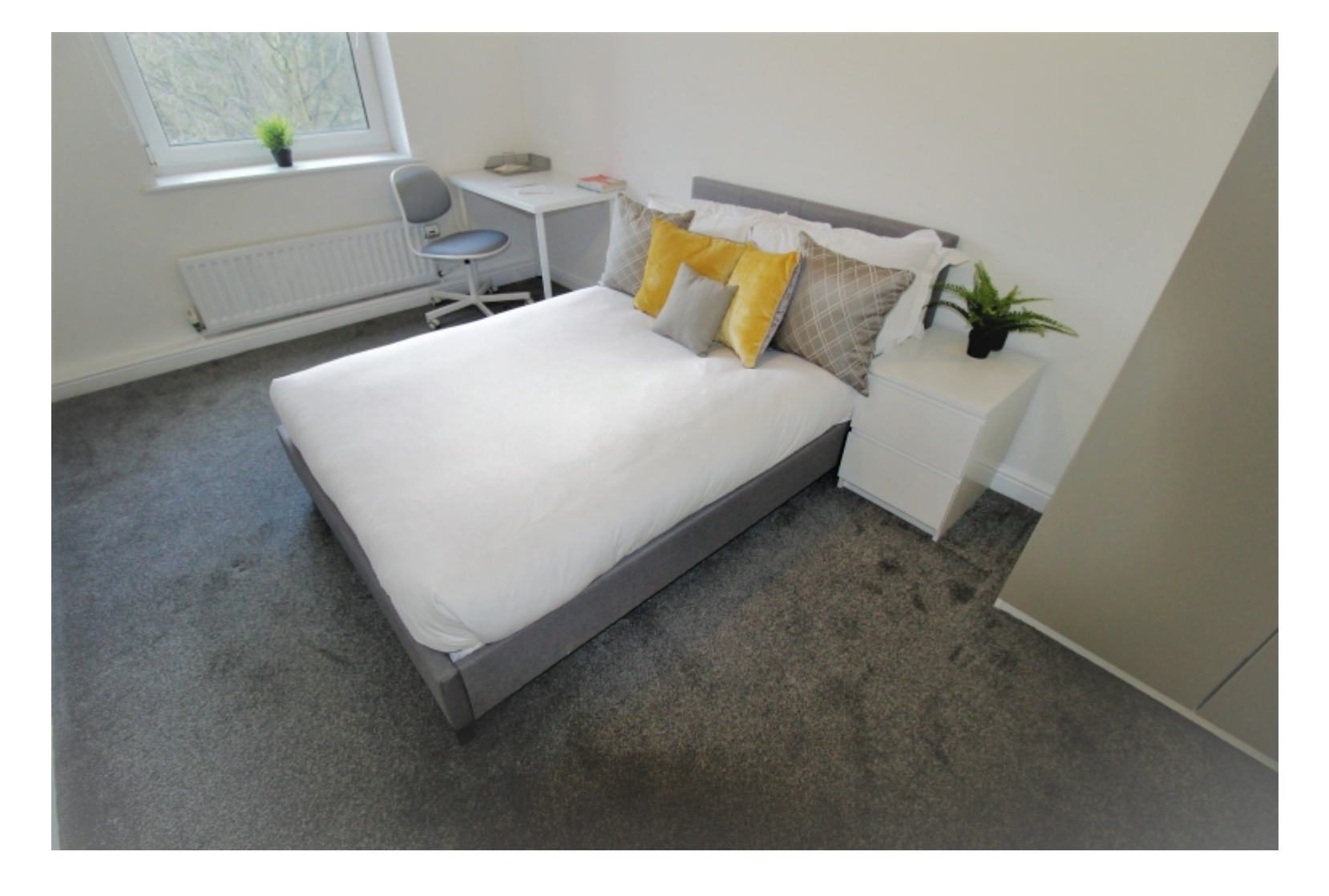
£130 Per Person Per Week