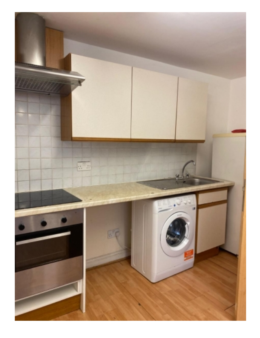
£125 Per Person Per Week